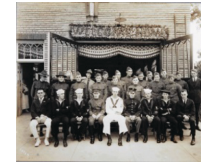
WWI Veterans, 1918